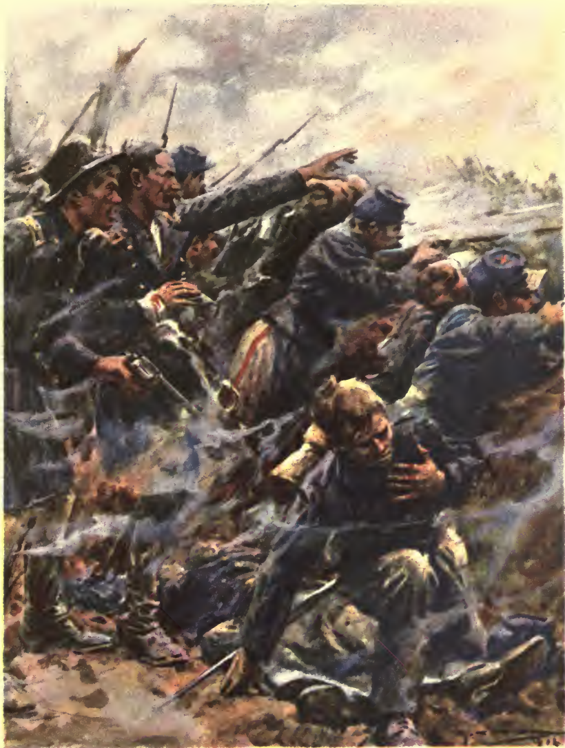
HIGH TIDE AT GETTYSBURG

This gallant and hopeless charge brought the battle of Gettysburg to an end. It brought victory to the Federal side, and the Confederates slowly retired into Virginia once more.